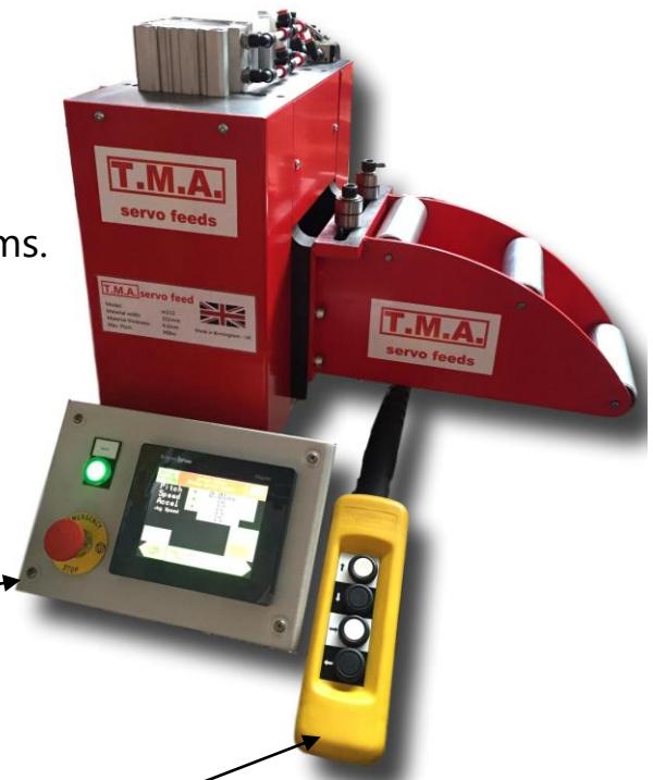
Pendant for jog, pitch & rolls open/close rolls - standard